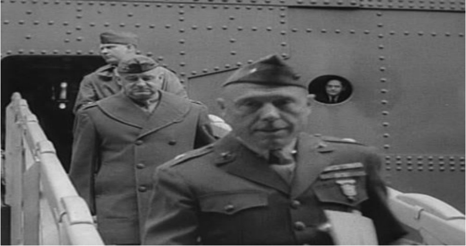
Major General William Henry Rupertus United States Marine Corp. November 14, 1889 – March 25, 1945 Author of the Rifleman's Creed

Major General Rupertus was 55 years old when he died but he served this country in two wars. He received a citation for extraordinary heroism and distinguished service as .....in action against enemy Japanese forces during the attack on the Solomon islands, August 7-9, 1942. He was commissioned November 13, 1913 as a Second Lieutenant in the USMC. As a First Lieutenant, he commanded the Marine Detachment aboard the USS Florida, attached to the British Grand Fleet in World War I. While on duty in Peking, China he endured the death of his first wife and two of his children. They died during a scarlet fever epidemic February 1930. During World War II, Major General William Rupertus served as Assistant Division Commander of the 1st Marine Division under Major General Alexander Vandegrift. During this time Major General Rupertus wrote the Rifleman's Creed. His purpose was to encourage expert marksmanship and Marines' trust in their weapons. He did not live to collect retirement. He died March 25, 1945 of a heart attack. He was buried in Section 6 of Arlington National Cemetery. In 1945, the U.S. Navy destroyer USS